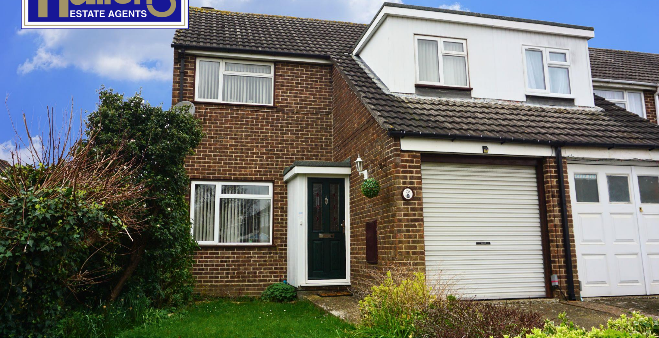
26 Masefield Road Thatcham Berkshire RG18 3AF